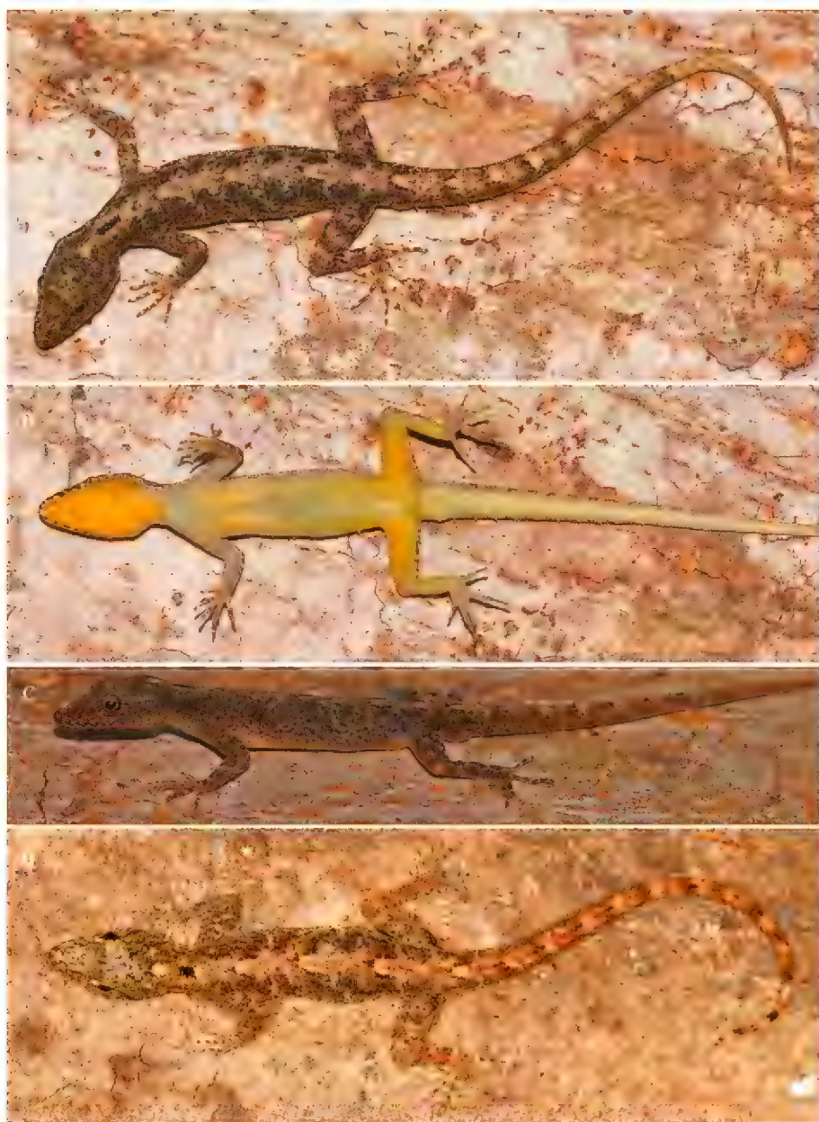
Fig. 4. Cnemaspis anslemi sp. nov. male holotype (NMSL.2019.14.01) in life in-situ. (A) Dorsal view of the full body displaying the typical color pattern and a straight black middorsal dash over midpoint of neck, (B) Ventral aspect showing gular and femoral colorations, (C) lateral view showing labial coloration and zigzag pattern, (D) dorsal view of the full body of female paratype (NMSL.2019.14.02) in life in-situ from Udamaliboda, Samanala Nature Reserve, Sri Lanka.